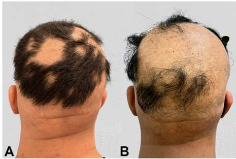
Fig 3. A 32-year-old man with moderate-to-severe alopecia areata ( A ) before (SALT 62%) and ( B ) 2 weeks after (SALT 70%) receiving the Moderna mRNA-1273 COVID-19 vaccine (first dose). SALT , Severity of Alopecia Tool.

no dose changes or treatment interruptions in JAKi systemic therapy or other medications were reported.