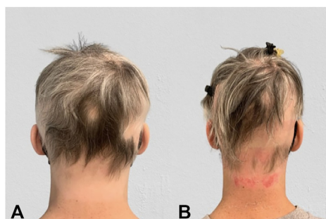
Fig 2. A 27-year-old man with moderate-to-severe alopecia areata (A) before (SALT 34%) and (B) 2 weeks after (SALT 59%) receiving the BioNTech/Pfizer BNT162b2 COVID-19 vaccine (second dose). SALT, Severity of Alopecia Tool.

In contrast, in our unvaccinated cohort, there was only 1 documented case of hair loss that interestingly following a SARS-CoV-2 infection, defined as mild (not resulting in hospitalization). A 50-year-old-woman reported hair loss 3 weeks after initially testing positive for SARS-CoV-2. The increase observed in her SALT scores were: SALT 8 to SALT