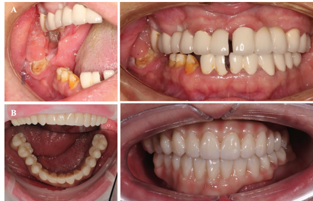
Fig. 2 (A) The tumor spread in the oral cavity. (B) 1 year postoperatively.

cervical lymph nodes, T4acN1M0, stage IVa, grade group II. Tumor size was 52 × 53 × 82 mm.