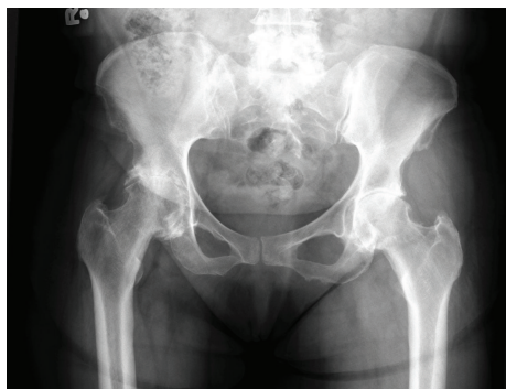
FIGURE 1: Preoperative AP pelvis radiograph demonstrating advanced degenerative changes of the right hip.