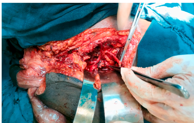
Fig. 2. Right testicular vessels were followed in retroperitoneum where they were identified and doubly ligated.