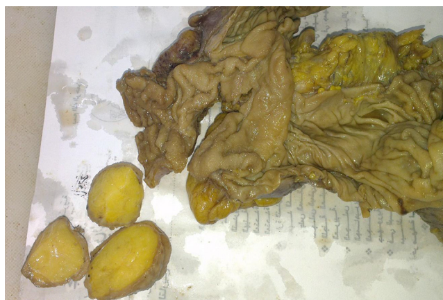
Fig. 3. Pathological photograph of tumor incised showed well circumscribed submucosal lesion.

There are several proposed methods to diagnose colonic lipomas. Lipomas would appear on ultrasonography as hyperechoic, well-circumscribed solid lesions with absent or minimal blood flow on color doppler sonography. However, definitive diagnosis is not possible [11]. A barium enema shows an ovoid filling defect with