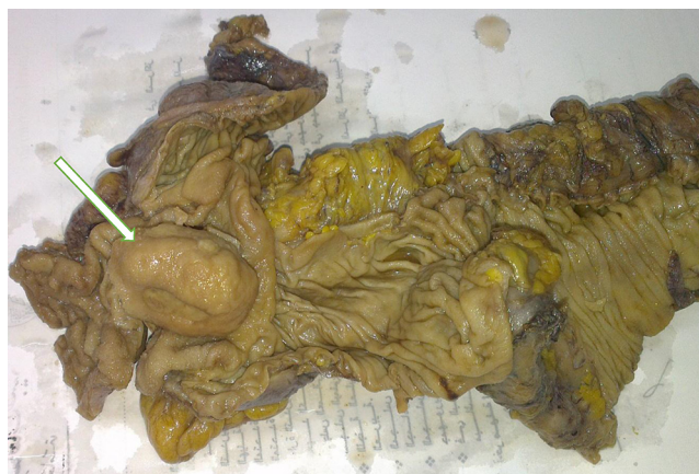
Fig. 2. opened cecum revealed large ileo-caecal polypoid tumor about 4.5 × 3 cm (arrow).

Colonic lipomas are mainly found in the ascending colon and cecum with a decreasing frequency from cecum to sigmoid. They originate from deposits of adipose connective tissue in the bowel with 90% of these lesions arising from the submucosa, while the remaining 10% arising from the subserosa or the intramuscular layer [3]. Moreover, transmural colonic lipomas have also been reported [6]. Colonic lipomas contain mature adipose tissue with a thick capsule usually surrounding the tumor. Secondary