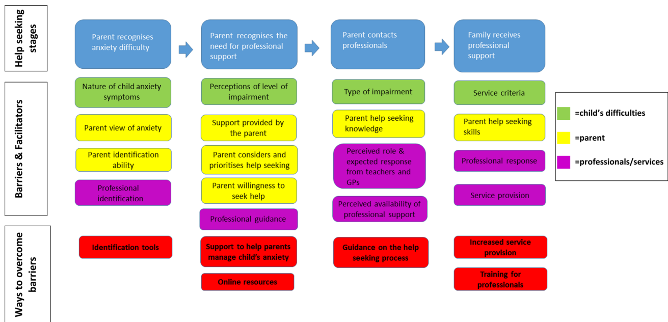
Fig. 2 Barriers and facilitators at four key stages of the help-seeking process