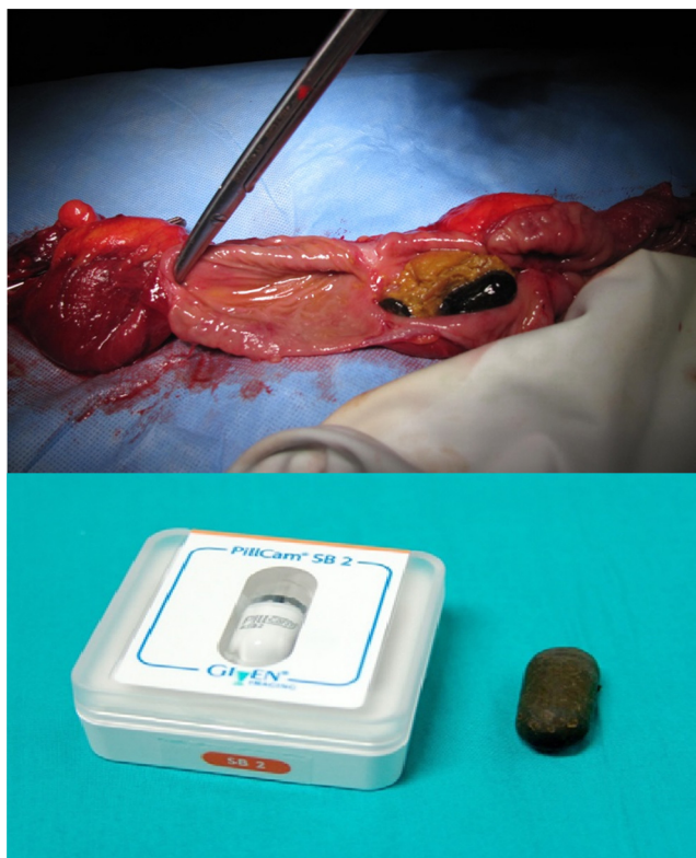
Figure 2 Segment of the resected small bowel containing the retained capsule.

The authors also reviewed the capsule study confirming that no stenosis was identified. Interestingly, the patient did not remember any abdominal symptoms during the 7 years of capsule retention.