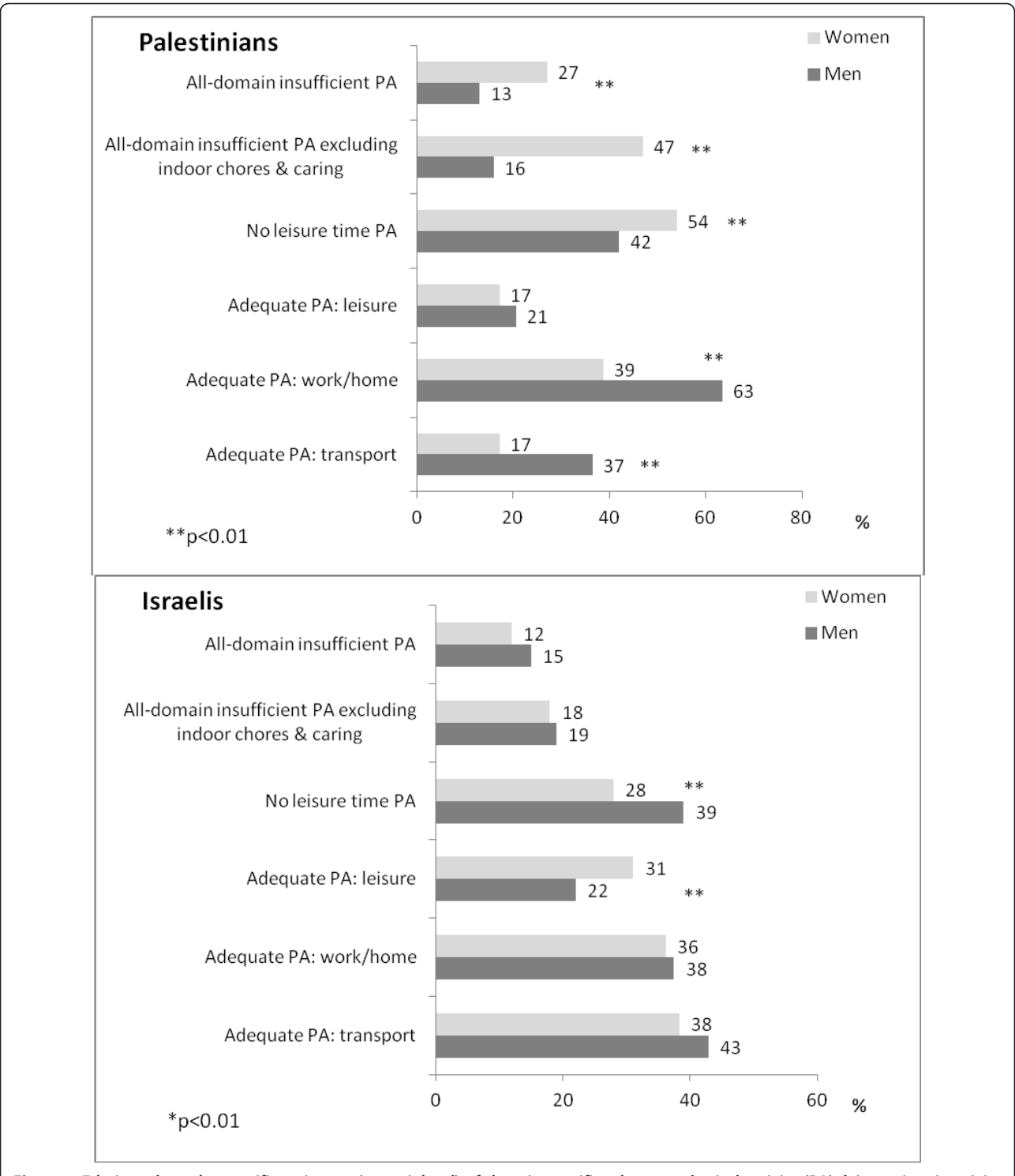
Figure 2 Ethnic and gender-specific estimates (%, weighted) of domain-specific adequate physical activity (PA), leisure-time inactivity and all-domain insufficient PA with all questionnaire items or excluding moderate household chores and caring.