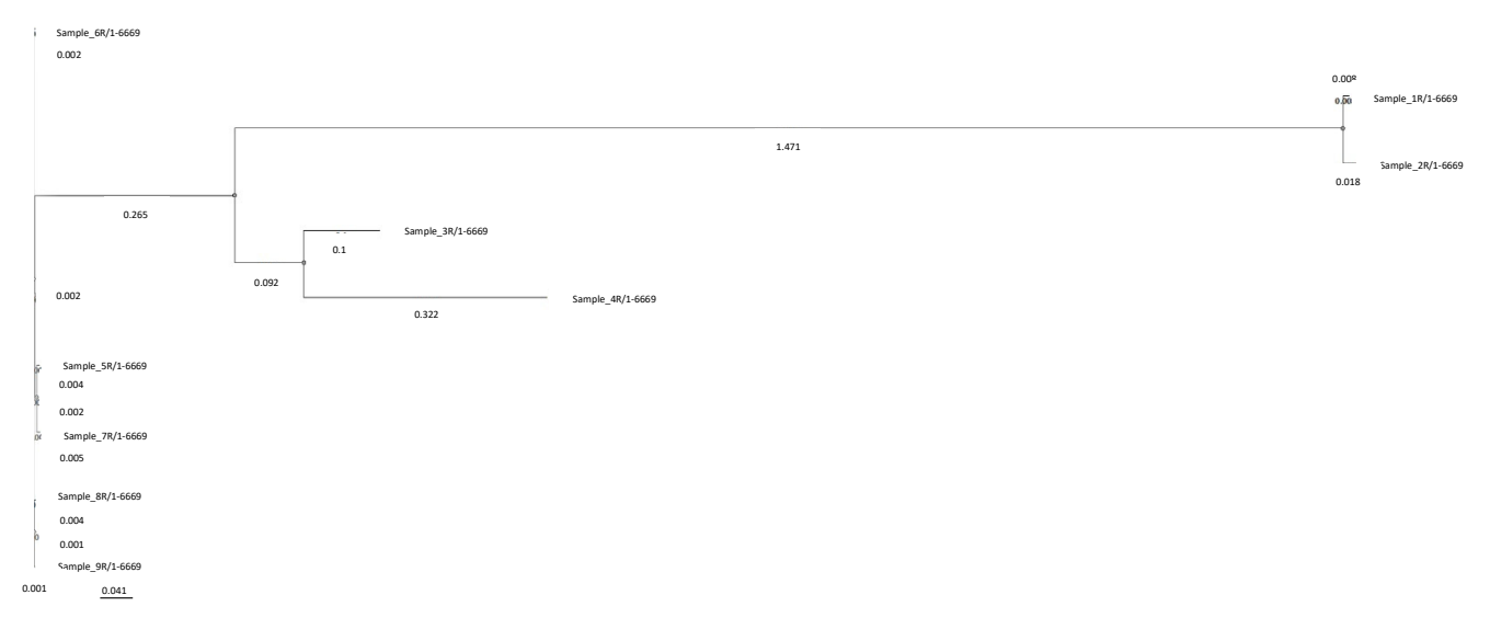
Figure 3. Phylogenetic tree of A. baumannii strains referred to RefGen A. baumanni ACICU, realized with the CSI Phylogeny tool.

Genomic Phylogeny (gPhyl) recognized three different lineages, as shown by the Whole Genome SNP-based phylogenetic tree (Figure 2). 5R, 6R, 7R, 8R, and 9R A. baumannii were grouped in gPhyl lineage-I, 3R, and 4R in gPhyl lineage-II and 1R and 2R in gPhyl lineage-III (Figure 3). gPhyl lineage-I only showed unstable COL<sup>R</sup> A. baumannii , gPhyl lineage-II had one stable and one unstable COL<sup>R</sup> A. baumannii , whereas gPhyl lineage-III only included stable COL<sup>R</sup> A. baumannii .