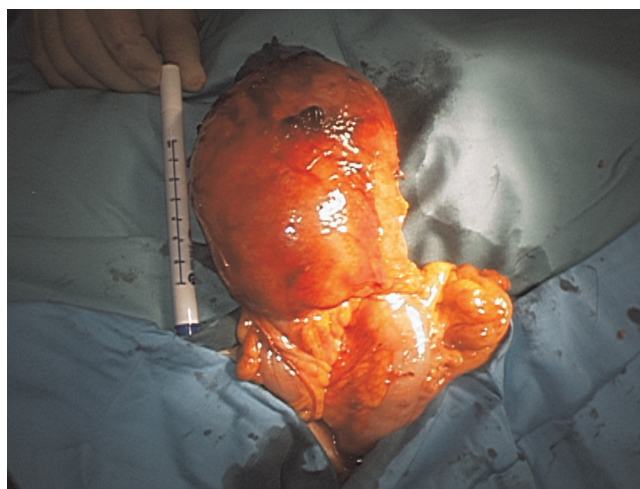
Figure 3. Externalised sigmoid colon and anti-mesenteric giant cyst.

Macroscopic assessment of the segmental colonic resection confirmed the presence of diverticular disease with an associated giant cyst measuring 11cm in maximal