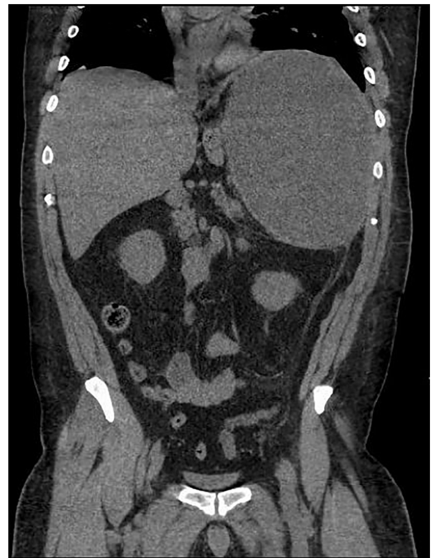
Fig. 2. Coronal view of large uniloculated cystic structure within the spleen.

There have been reports of abscess formation in patients with recent COVID-19 infection. Al Zarooni et al. published a case series in which three patients with COVID-19 developed splenic abscesses without other