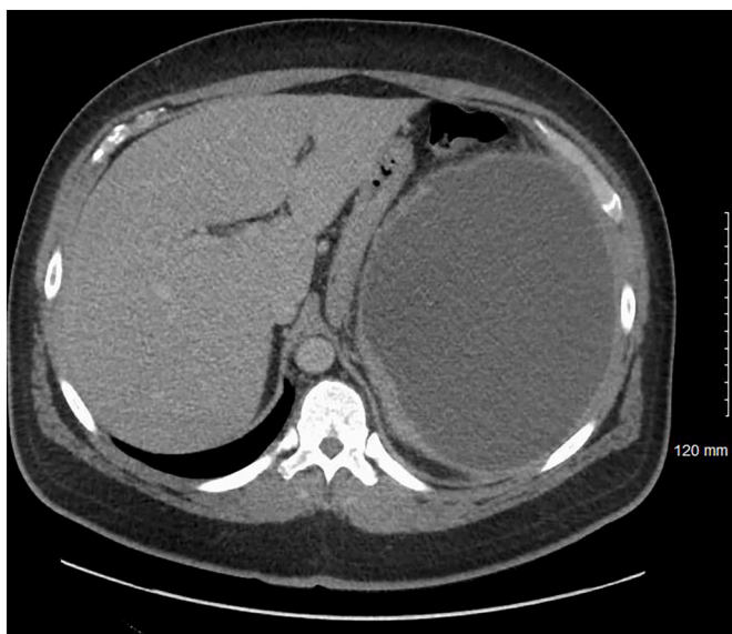
Fig. 1. Axial imaging demonstrating large uniloculated cystic structure within the spleen.

Once a splenic abscess has been diagnosed, treatment should be initiated with broad-spectrum intravenous antibiotics. Blood cultures may be used to guide antibiotic selection; however, aspirate from the abscess should be sent for bacterial culture and ultimately guide antibiotic therapy [8]. Traditionally, splenectomy has been the standard of care for splenic abscesses, though, given the spleen's important immunologic function, its removal is associated with risk of overwhelming post-splenectomy infection (OPSI). Recently, percutaneous drainage has become the favored initial intervention for splenic abscesses. One meta-analysis of splenectomy versus percutaneous drainage for splenic