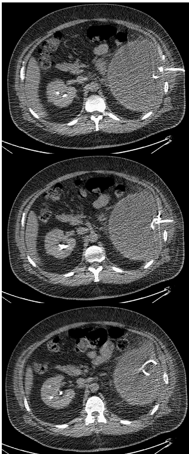
Fig. 3. Pigtail catheter placement by interventional radiology.