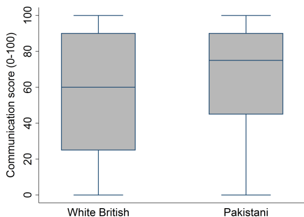
Figure 3 Box plots showing the distribution of GP communication scores recorded by White British and Pakistani participants.

The distribution of communication scores for White British and Pakistani participants is shown in figure 3 . The data are skewed in both groups, with high communication scores given more often; however, the