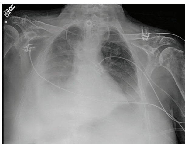
Figure 1: Portable chest x-ray: Showing hazy opacification of a portion of the right hemithorax with obliteration of the right hemidiaphragm and fluid extending up the lateral chest wall to almost cap the apex. Left hemidiaphragm is also somewhat hazy suggesting infiltrate and/or fluid

Although the pathophysiology continues to be poorly understood, its etiology is described as being multifactorial. It results from the combination of tissue hypoperfusion, impaired local defense barriers, and a massive influx of gastric contents, which weaken and damage the esophageal mucosa. The distal one-third of the esophagus is vulnerable to ischemia due to a relatively poor vascularity. Some of the risk factors identified, which include diabetes mellitus, malnourishment, atherosclerosis, renal insufficiency, and sepsis, all which may contribute to ischemia and tissue hypoperfusion. [3-8] In a prospective study performed by Soussan et al. for eight patients, three patients had diabetes mellitus, five patients had only involvement of the distal esophagus, and four patients died in <14 days. [9]