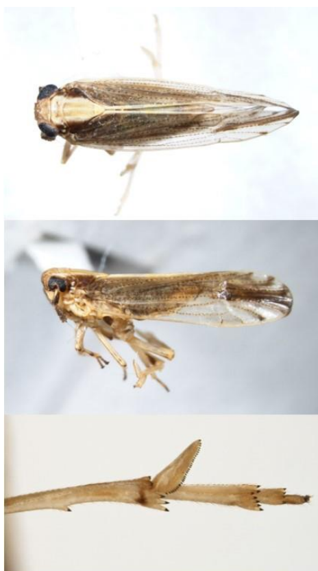
Figure 5. Perkinsiella saccharicida adult dorsal view (top), lateral view (middle), and hind tibia spur (bottom).

The sugarcane leafhopper, Perkinsiella saccharicida Kirkaldy (Hemiptera: Delphacidae), is a brown planthopper (4.5–6 mm) with light-colored dorsal markings on the head and thorax (Figure 5) [56]. The species can be identified by the presence of short clubbed antennae and a flattened spur on the apex of the hind tibia [56]. Substantial polymorphisms exists among adults with both macropterous and brachypterous individuals of both sexes having been observed [57]. There is no record, however, of brachypterous adults from North America. Nymphs resemble adults in structure and coloration, but lack wings.