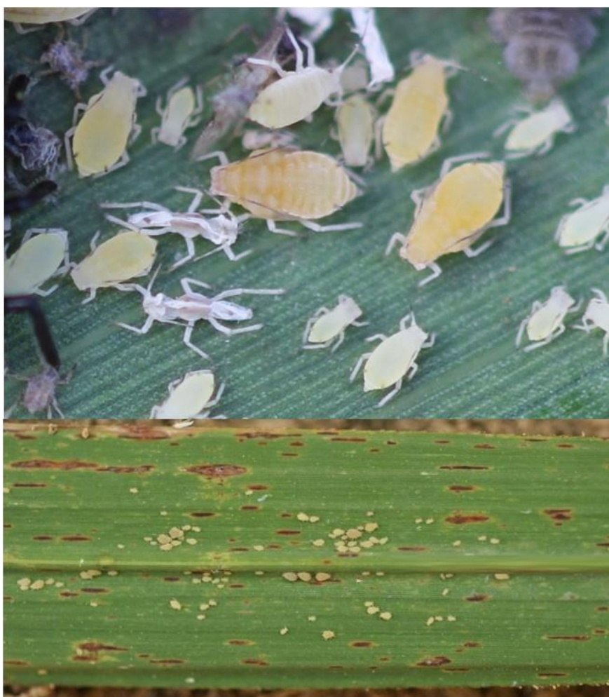
Figure 1. Melanaphis sacchari adults, nymphs, and exuvia (top); and colony on the underside of a sugarcane leaf (bottom).

The life cycle of M. sacchari is anholocyclic with colonies feeding on primary hosts during the spring and summer, and overwintering only in regions where host plants remain green through the winter, including Mexico, southern Texas, Florida, and the southern-most regions of Louisiana, Mississippi, and Alabama bordering the Gulf Coast [7]. Reproduction is characterized as parthenogenic viviparity. The North American population is primarily asexual, but sexual reproduction has been reported in Asia [8–10]. Development to adulthood is highly variable depending on temperature and host plants generally ranging from 4.3 to 12 days [6,11,12].