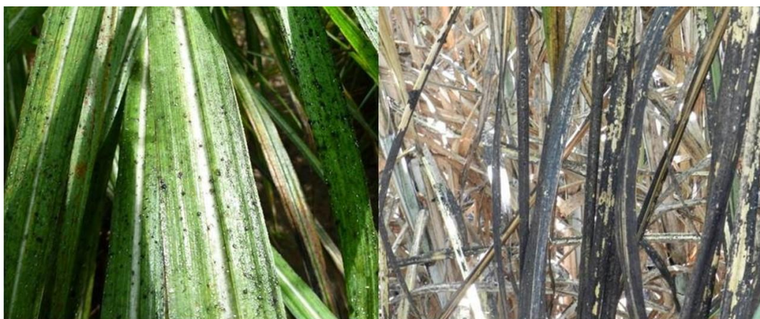
Figure 4. Sugarcane leaves covered in honeydew produced by S. saccharivora (left), and resulting sooty mold (right).

populations in the Caribbean has led to it being frequently referred to as an important economic pest [44–46]. Unfortunately, none of these studies provided data-based evidence that infestations result in observable yield impacts. Attempts to document yield impacts during the 2012 and 2016 Louisiana outbreaks produced inconsistent results. In the study by Wilson et al. [47], a 36% loss in sugar yields was observed in non-treated plots relative to insecticide-protected plots in a single experiment. Yield was impacted to a lesser extent in large plot trials, but S. saccharivora infestations were not quantified in that trial. No impacts were observed in four additional experiments reported therein which had comparable levels of infestation. Furthermore, the Louisiana sugarcane crop yield in 2012 was among the highest ever recorded despite widespread S. saccharivora infestations going largely uncontrolled [47]. Thus, it was concluded that S. saccharivora infestations have potential to impact sugar yields, but that this highly variable relationship is likely dependent on numerous factors. Impacts of S. saccharivora on yields are thought to be influenced by infestation timing, duration, sugarcane variety, and environmental conditions. While determination of the pest status of S. saccharivora will require further research efforts, pest management research has provided evidence that effective controls can be implemented to respond to outbreaks.