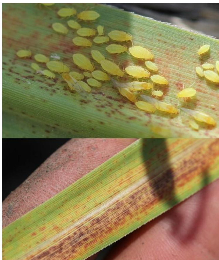
Figure 2. Yellow sugarcane aphid, Sipha flava , nymphs, adults, and alates (top); and reddening/yellowing of sugarcane leaves caused by S. flava feeding (bottom).

Yellow sugarcane aphids, Sipha flava (Forbes) (Figure 2 (top)), are small (<2 mm), brightly colored aphids with numerous hairs covering the head, thorax, and abdomen. Rows of dark spots dot the abdomen and the cornicles are reduced in size relative to other aphid species. Alate forms maintain bright yellow abdomens, but the head and thorax are darker in color [35]. The species is parthenogenic throughout the year in warmer regions of its range, but sexual forms occur where low winter temperatures induce oviparity [8]. Development to adulthood takes 8–15 days and is highly dependent on temperature and host plants. Development occurs more rapidly on sorghum than on sugarcane [11,36].