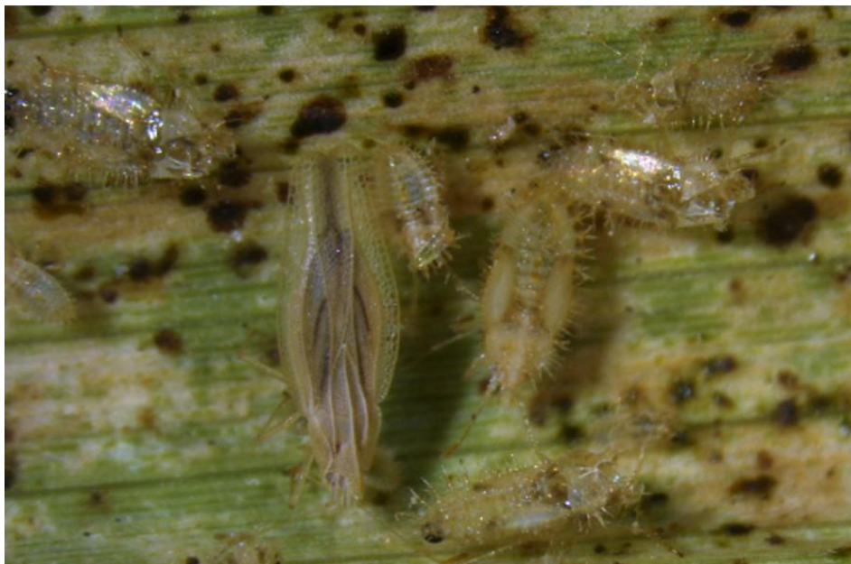
Figure 6. Leptodictya tabida adult and nymphs feeding on a sugarcane leaf.

the genus Leptodictya [68]. Adults are flat and oblong (3.5–4 mm in length) [69] with white or cream coloration (Figure 6). Five spines are apparent on the head. Antennae are long and thin. Elytra are transparent with the characteristic lace-like wing venation typical of tingids and extend beyond the abdomen. Nymphs are more yellowish in coloration with numerous white spinules protruding in all directions. [68,69].