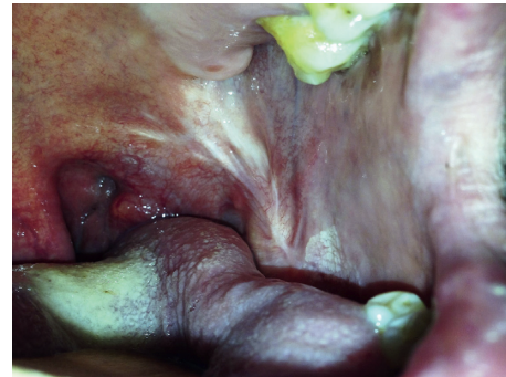
FIGURE 3: Left buccal mucosa one year after the operation. A scar tissue is present, and there is no sign for relapse.

Diabetes mellitus (DM) is a clinical entity with hyperglycemia due to insulin defect. Disregulation of insulin, glucose, and lipids can lead to skin lesions in some DM patients [16]. Grinspan et al. reported an association of OLP with DM and VHT and called that Grinspan's syndrome [11]. However, with the presentation of three cases, drug therapy for VHT and DM was blamed to produce lichenoid reactions for Grinspan's syndrome [17]. In our case, OLP is associated with DM, VHT, and OSCC. Our patient had been followed up for OLP for 10 years and for DM for 5 years being treated with saxagliptinum 5 mg/day for 3 years and insulin 25 units/day at nights for 5 years. VHT is diagnosed just before the surgery and treated with perindoprilat-indapamide (5–12.5 mg/day). So, he did not use any DM or VHT drugs before the OLP