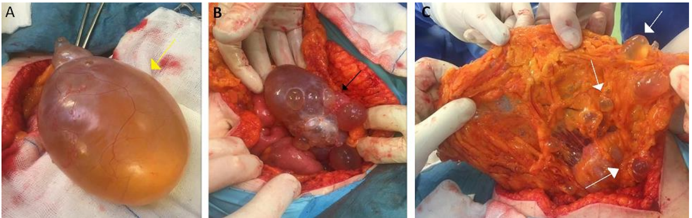
Figure 2: perioperative findings shows: A) large left ovarian cyst (yellow arrow) B. right ovarian cyst (black arrow); C) small cysts in the peritoneum (white arrows)