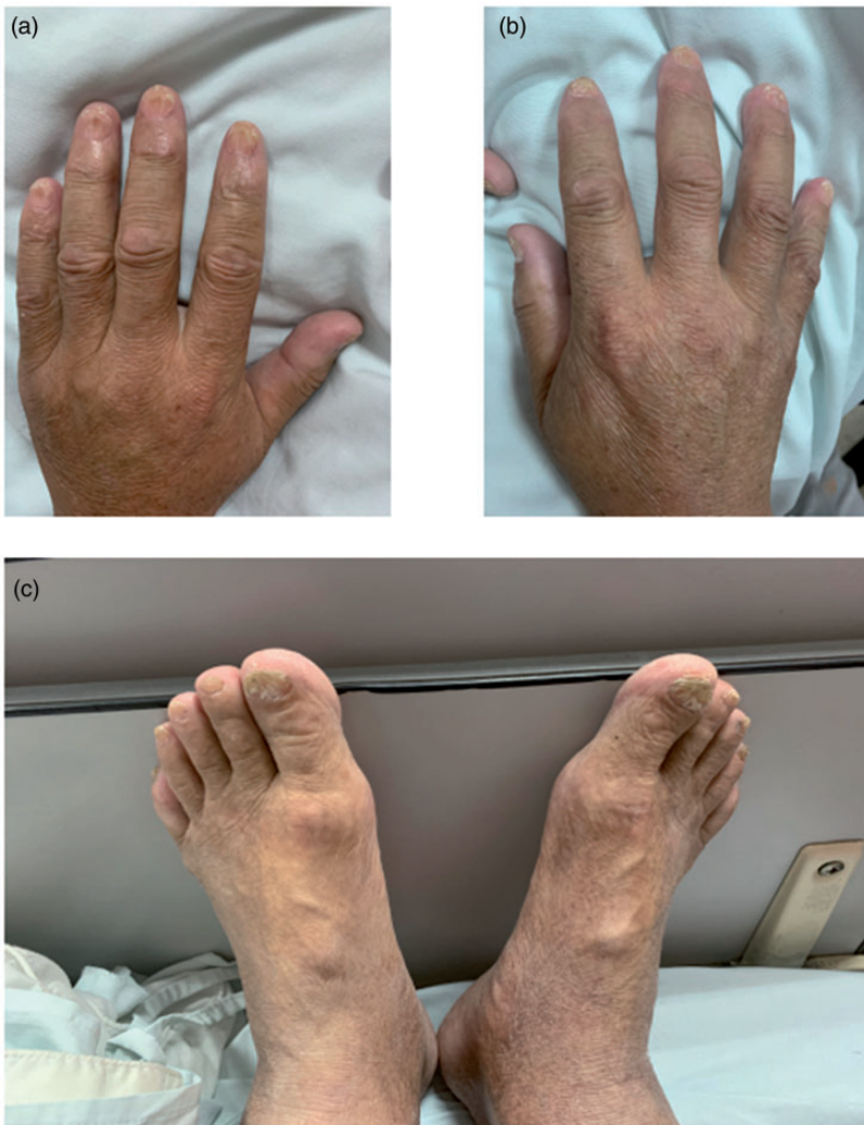
Figure 1. Photographs of the patient's hands and feet showing (a) left fingernails; (b) right fingernails; (c) toenails.

there was no evidence of cardiac failure. His lower lobe respiratory sounds were faint, and chest percussion revealed dullness. His fingernails and toenails appeared yellow and thickened with excessive curvature and onycholysis (Figure 1). B-mode ultrasonography showed bilateral pleural effusion (Figure 2a,b) and multiple areas of edema on the chest wall, neck, and in the axillae, and chest computed tomography