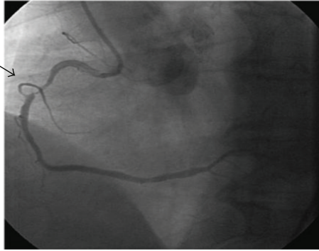
FIGURE 1: RCA angiogram showing >90% stenosis.