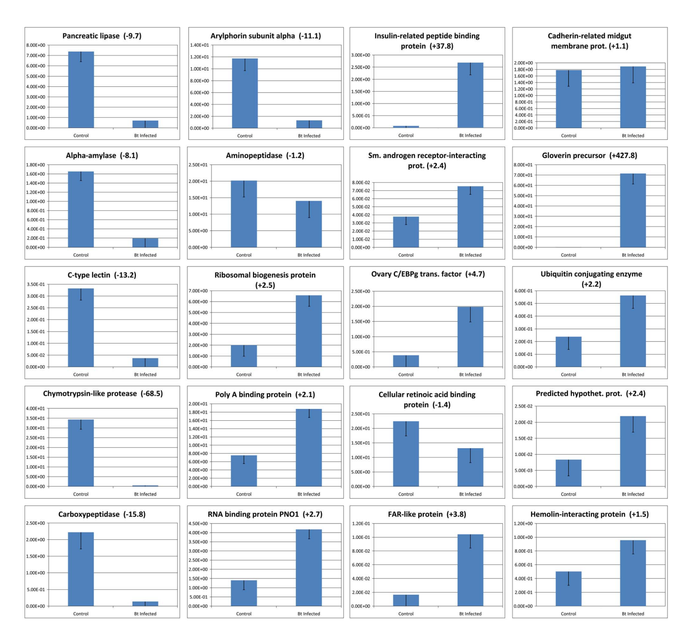
Figure 3. qRT-PCR Results. Quantitative real-time PCR analysis data for 20 select Lymantria dispar midgut genes are presented. Three technical replicates were performed for each of three biological replicates. The height of each box represents the mean average of sample-specific 2<sup>-ΔCt</sup> values, while associated error bars denote the standard error of the mean. Fold changes are shown in parentheses. doi:10.1371/journal.pone.0061190.g003

Table 3. Impacts of quality filtering and rRNA depletion on resultant RNA-Seq dataset sizes.