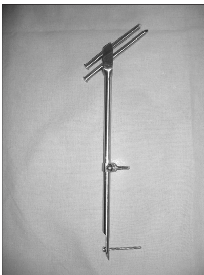
Fig. 3. Selfdynamisable internal fixator.

The average operating time was 45 minutes (range, 32 to 90 minutes). The blood loss averaged 250 mL (range, 125 to 350 mL). The average hospital stay was 10 days (range, 7 to 59 days). The mean follow-up time was 22.3 months (range, 15 to 30 months). Implant failure was not observed and fracture union was achieved in all the patients. The mean union time was 14 weeks (range, 12 to 20 weeks) (Fig. 1C and Fig. 2C). Varus malalignment less than 10° occurred in three (6.1%) patients at the end of follow-up. Shortening of the limb due to dynamisation was recorded in 17% of the patients with the average shortening being 0.6 cm (range, 0.2 to 1.0 cm) (Fig. 4). Rotational malalignment and deep venous thrombosis were not recorded in any patients. At the time of the review, 35 patients were pain-free and 14 had mild pain and they used medicine. Ten patients had pain due to arthritic changes in the lumbosacral region of the spine, while four patients had pain because of hip arthrosis. None of the fractures required a