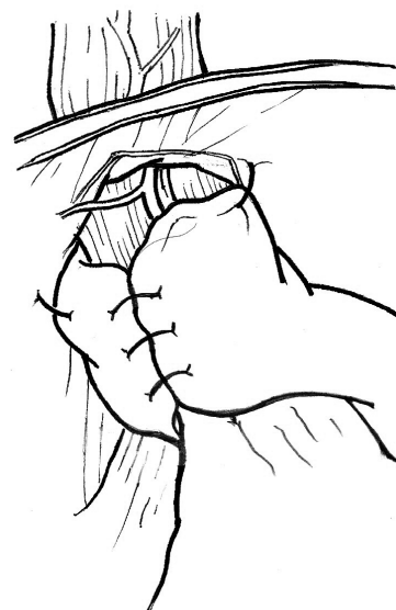
Fig. 2. Schema of completed Nissen fundoplication.