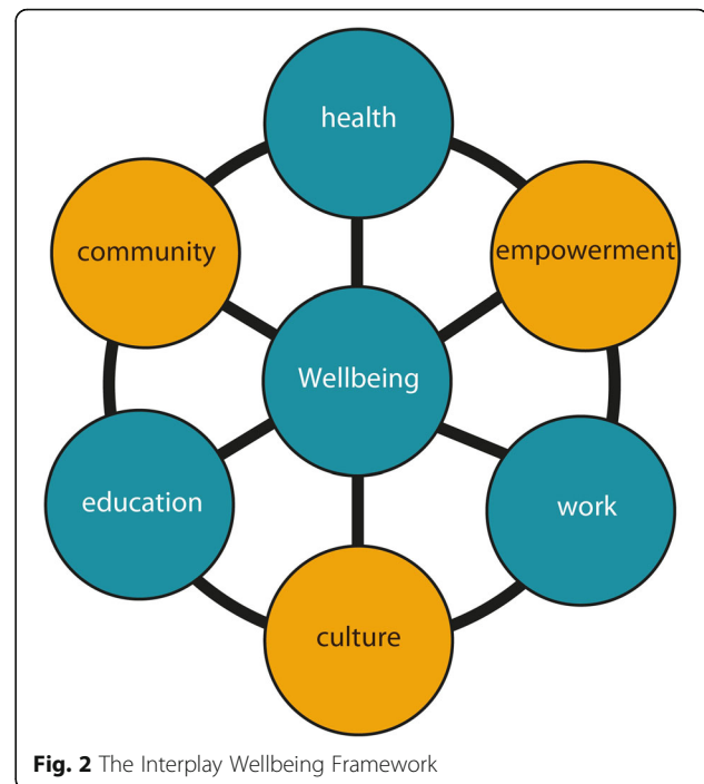
Fig. 2 The Interplay Wellbeing Framework

The consultation process was also used to inform the definition and measurement of the constructs of culture, empowerment and community, and provide more contextually relevant definitions of the government priority areas of education, employment and health [25]. For example, the definition of education was broadened to include the teaching and learning that happens outside of the school, as part of cultural learning and development. Employment was also broadened to accommodate the