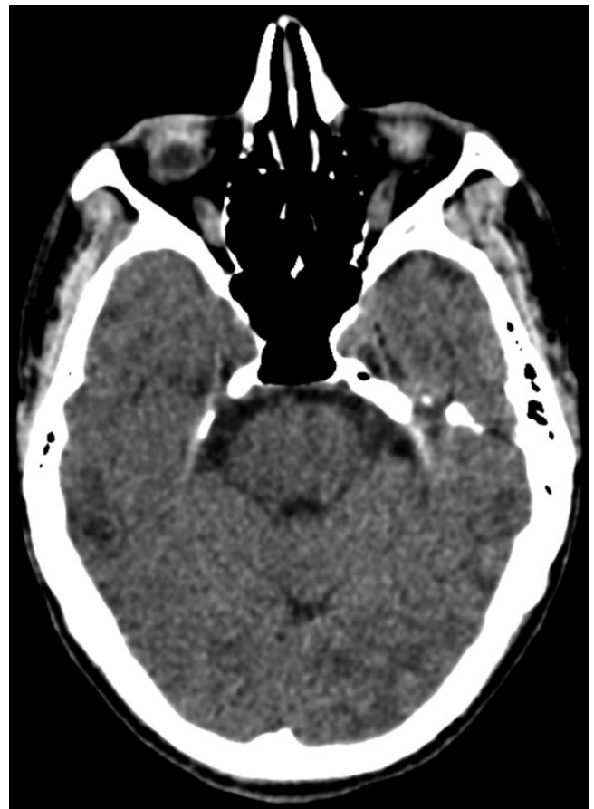
Figure 4. Initial computed tomography of the head revealing a lesion in the right temporal lobe.

Nocardia sp was confirmed on culture so treatment for TB was therefore discontinued and replaced with trimethoprim-sulfamethoxazole (TMP/SMX), imipenem, and amikacin while awaiting final speciation and susceptibility test results.