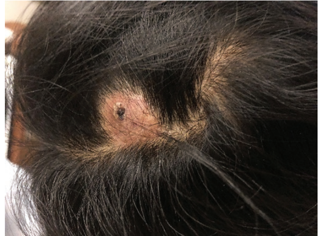
Figure 3. Parietal scalp lesion on presentation.

Nocardia sp was confirmed on culture so treatment for TB was therefore discontinued and replaced with trimethoprim-sulfamethoxazole (TMP/SMX), imipenem, and amikacin while awaiting final speciation and susceptibility test results.