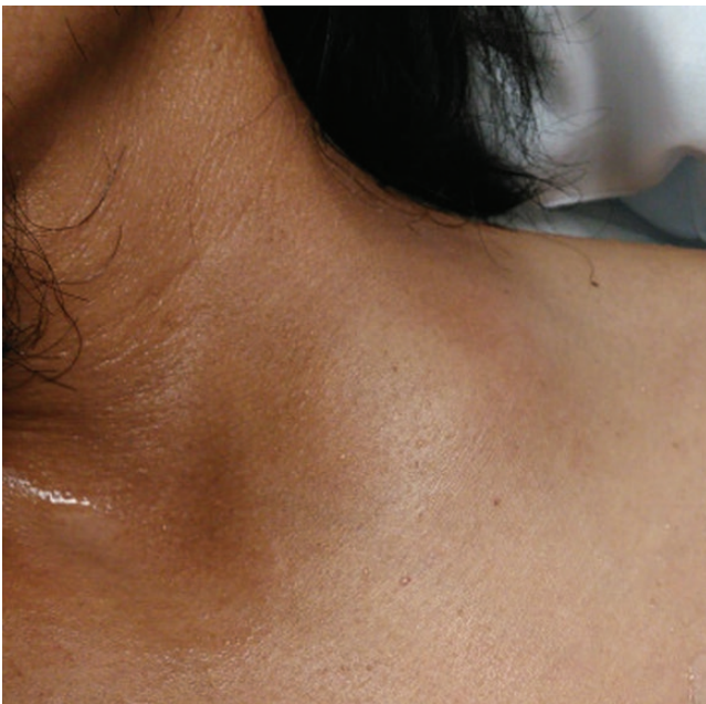
Figure 2. Left supraclavicular mass on presentation.

from anti-tuberculous therapy, and disseminated fungal infection. Microscopy revealed branching, beaded Gram-positive rods (Figure 5). A lumbar puncture was performed, and analysis of the cerebrospinal fluid was unremarkable. Repeat MTB NAA was negative. Other tests for Blastomyces antibody, Aspergillus galactomannan, cryptococcal antigen, and antibody for Toxoplasma immunoglobulin (Ig)G and IgM were all negative. Cerebrospinal fluid analyses for AFB and fungal and routine bacterial cultures, cryptococcal antigen, and Toxoplasma polymerase chain reaction were all negative (Supplementary Table 2).