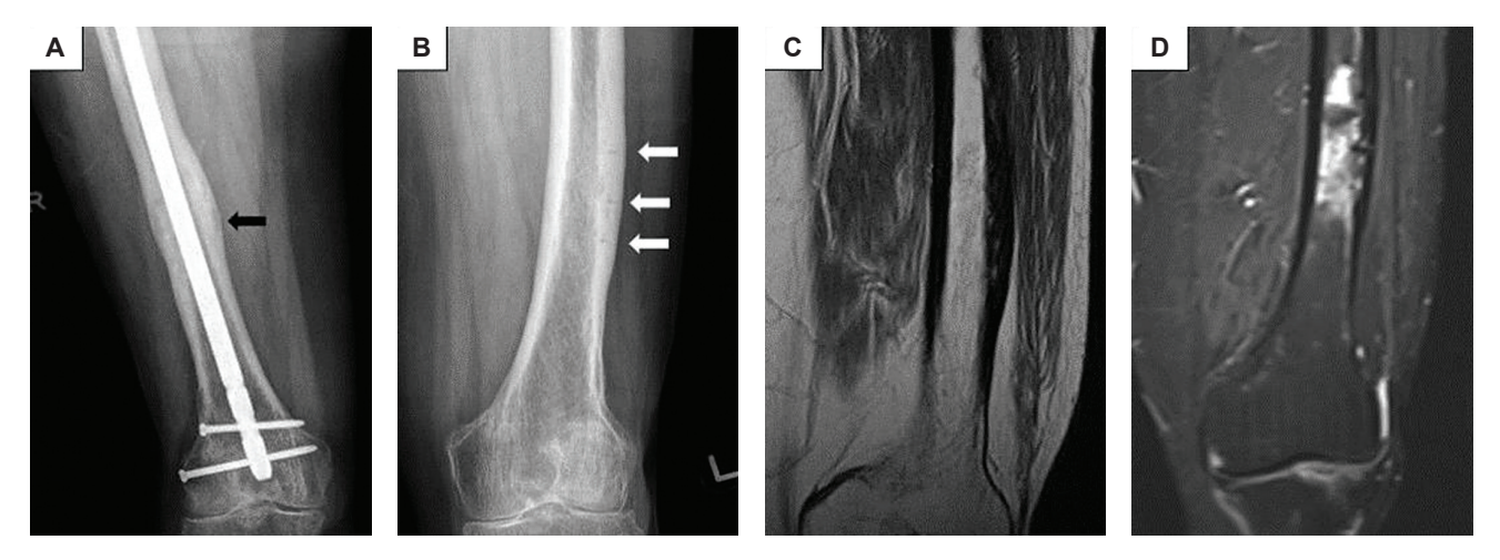
Figure 3. Radiographs and Magnetic resonance imaging (MRI) during follow-up visits in 2020 and 2022. (A) Radiograph of right femur at 10 months (2020) after surgery showing callus formation, progressive healing of right mid-shaft AFF (black arrow) and stable alignment of the IMN. (B) Radiograph of left femur taken in 2022 showed persistence of the transverse lucent lines and thickened lateral cortex (white arrows), suggestive of persistent incomplete AFFs. (C) Turbo spin-echo proton-density weighted (TSE PD) MRI of left thigh showing chronic periosteal thickening and cortical sclerosis of the lateral aspects of the distal femoral shaft while (D) Turbo inversion recovery magnitude (TIRM) MRI shows irregular intramedullary high fluid signal of the distal left femoral shaft adjacent to the area of chronic cortical sclerosis, likely reflecting areas of bone marrow oedema secondary to reparative process from atypical cortical stress fractures.

It is interesting that our patient has long-standing hyperthyroidism, a condition usually associated with accelerated bone remodeling.<sup>8</sup> Hyperthyroidism shortens the bone turnover cycle from seven months to three to four months, by increasing the number of osteoclast resorption sites. The ratio of bone resorption to bone formation is increased, leading to cumulative new bone loss and osteoporosis. Unfortunately, we do not have bone histomorphometry analysis of the AFF lesions. To our knowledge, this is the first reported case of persistent AFF in a BP-naïve patient and in a patient with Graves' disease.