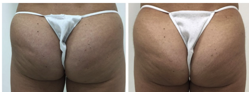
Fig. 4. Before (left) and after (right) five treatments in the buttocks with poly-L-lactic acid (one vial).