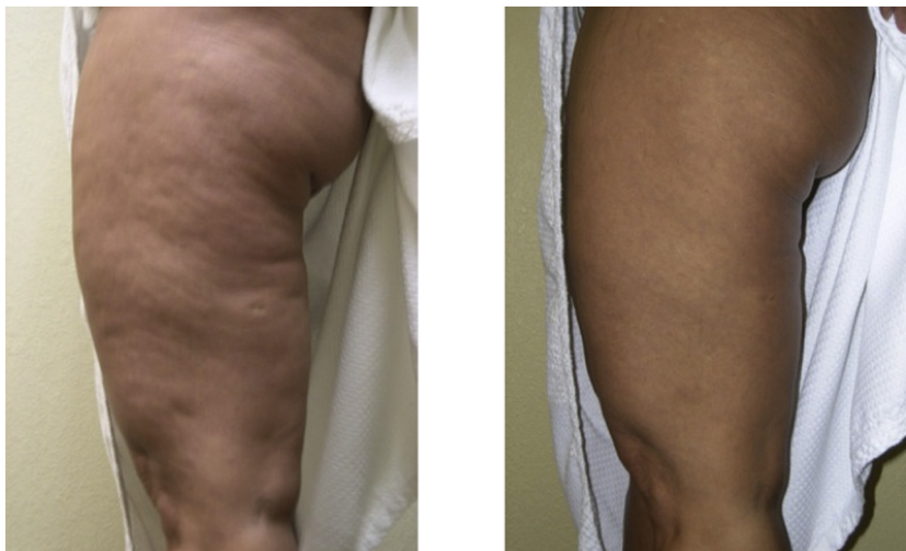
Fig. 2. Before (left) and after (right) one treatment in the buttocks with 1440 nm Cellulaze.

Collagenase enzymes isolated and purified from the fermentation of Clostridium histolyticum are used in clinical trials for the treatment of cellulite. Collagenase I (AUX-I; Clostridial class I collagenase) and Collagenase II (AUX-II; Clostridial class II collagenase) are not immunologically cross-reactive and have different specificities; mixed in a 1:1 ratio, they become synergistic and provide a very broad hydrolyzing reactivity toward collagen (Yang and Bennett, 2015). Thus, they can hydrolyze the triple-helical region of collagen and have the