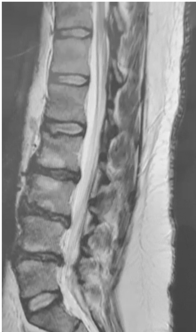
FIGURE 1 MRI of the lumbar spine before treatment showing bulging of the discs between L5 and L2 region

A physical examination was performed to determine the severity of symptoms and possible causes. Palpation of the patient revealed severe tenderness in the mid-thoracic and lumbosacral spine area, moderate to severe limitation of trunk flexion due to pain, and positive straight leg raise (SLR) test on both sides. Because of the mid-thoracic pain, X-rays were taken of the thoracic area but thoracic MRI was not required because clinicians determined that the thoracic X-rays did not reveal a potential problem (Figure 3).