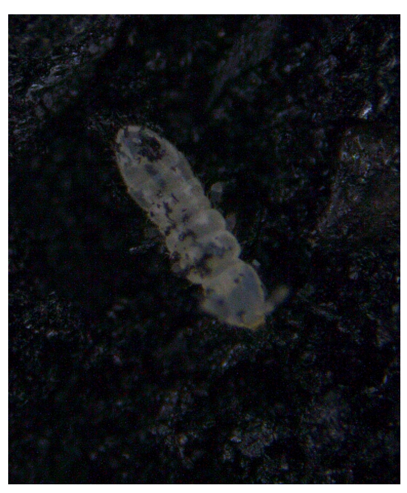
Fig 2. Folsomia candida individual covered with pine bark biochar particles and biochar particles in the gut. https://doi.org/10.1371/journal.pone.0224179.g002

Additionally, we found Folsomia candida individuals which, after jumping into the pine bark particles, were covered with a large number of particles that remained on them even when the animals left the pile of biochar (Fig 2). In addition, we observed in nearly every collembolan black dots in the gut, indicating that they ingested microparticles by grazing the surface of larger biochar particles and hence could defecate them somewhere else ([23]; [24]; [19]; [15]).