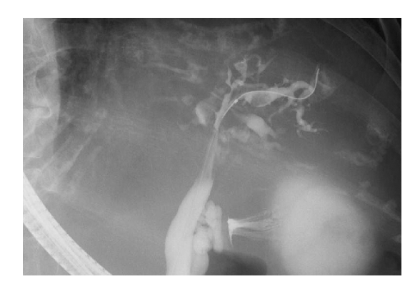
Figure 3. Endoscopic retrograde cholangiography (ERC) demonstrated cystic dilated biliary ducts with stones.

Hepatic phenotype variants have been previously reported in ADPKD patients. Dranssart et al. observed intrahepatic bile duct abnormalities in 25 of 90 ADPKD patients (27.8%) with magnetic resonance cholangiography, which were correlated with hepatobiliary infection (16). Ishikawa et al. reported that common bile duct dilatation occurred more frequently in ADPKD patients than in non-ADPKD patients (17). Terada et al. examined specimens from autopsied livers and biliary tracts of three patients with ADPKD using intrahepatic cholangiography and found nonobstructive dilatation of the intrahepatic bile ducts in all cases (18). Jordon et al. reported the 17-year history of an ADPKD patient with a recurrent fever of unknown origin that was later attributed to Caroli's disease with multiple episodes of cholangitis (4). These phenotypic variants might be due to dif-