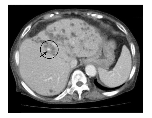
Figure 2. Contrast-enhanced abdominal CT showed the central dot sign (circle), representing the fibrovascular bundle (arrow) within the dilated cystic intrahepatic ducts, which is considered to be a characteristic feature of Caroli's disease.

A mutation in PKD1 encoding polycystin-1 or PKD2 encoding polycystin-2 gives rise to ADPKD. The identified gene underling ARPKD is PKHD1 encoding fibrocys-