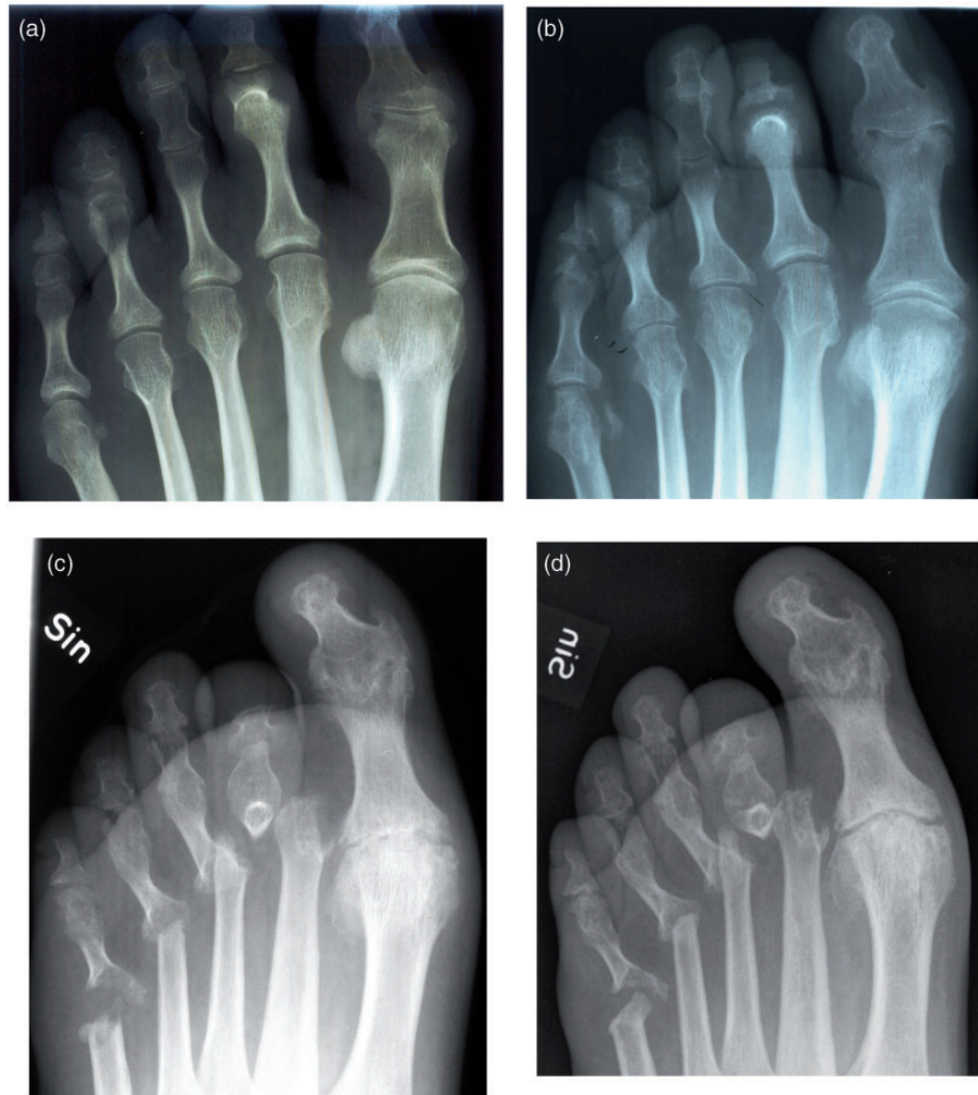
Fig. 1. Serial radiographs from 1981 (a), 1988 (b), 2001 (c) through 2010 (d), showing typical changes of psoriatic arthritis mutilans in the left foot of a 58-year-old male patient.

have been made as early as in 1988, or 9 years previously, i.e. instead of 1997 when the diagnosis of PAM was first mentioned.