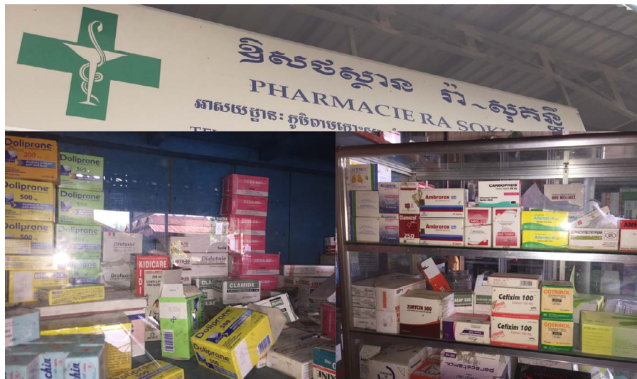
Figure 2. Medicines available at a local drug shop.