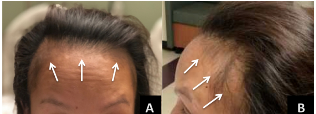
FIGURE 1: Non-scarring frontal alopecia

On physical examination, non-scarring alopecia was present over the frontal marginal hairline (Figure 1A, 1B). Her eyebrows, skin, and mucous membranes appeared normal. Fundoscopic examination revealed bilateral optic disc edema (Figure 2A, 2B), classified as grade III, which is characterized by a peripapillary circumferential halo with decreased translucency and at least one obscured major vessel as it passes the optic disc margin [5]. The remainder of the physical exam was unremarkable.