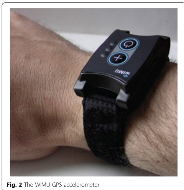
Fig. 2 The WIMU-GPS accelerometer

Daily activity count (AC) were defined as the mean activity count per minute of active time. Three other variables were obtained by separating the activity counts in three categories: low-intensity activities (LIA), moderate-intensity activities (MIA), and high-intensity activities (HIA). These were obtained by distributing the activity counts and defining LIA as activities below the 33rd percentile, MIA between the 33rd and 66th percentile, and HIA above the 66th percentile. These three variables are reported as a percentage of the total number of activities detected.