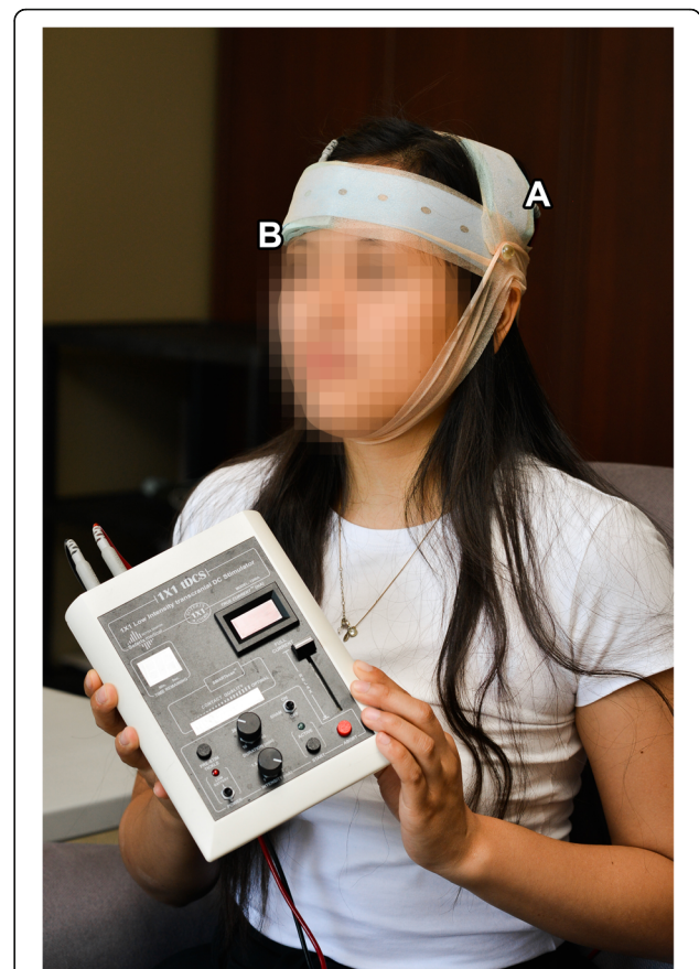
Fig. 1 a-tDCS assembly. The anode (a) was applied on the M1 cortical zone for the rotator cuff as identified using TMS. The cathode (b) was applied over the contralateral eyebrow. The sponge electrodes were then secured with rubber band and adhesive tape and soaked in saline

The WORC and QuickDASH were both completed at four timepoints: just prior to the CSI injection, 2 weeks following CSI and prior to a-tDCS treatment, and 4 weeks following CSI. The WORC is a pathology-specific health-related quality of life questionnaire and has been well validated for the follow-up of rotator cuff disease [34]. The final score is reported on a scale from 0 to 100 points, with 100 points representing better function. The QuickDASH is a more general measure of upper