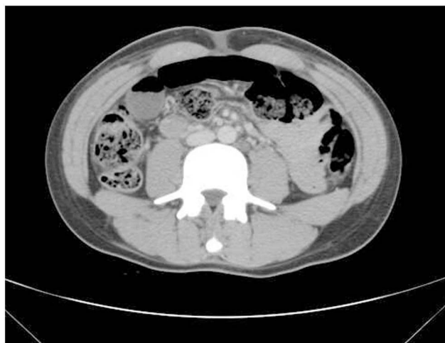
Figure 1 Enhanced abdominal CT taken on day 14. Part of the intestine was dilated and there was gas and fluid accumulation, and the gas-liquid level was visible.

treatment, including fasting, gastrointestinal decompression and stomach protection. The symptoms of abdominal pain gradually relieved over days. The count of WBC reached a maximum of 41.45 \times 10^9/L , IDA (5 mg/day for 2 days) was then adopted. The WBC count gradually decreased. On day 25, the patient's blood cells had recovered after supportive treatment, and he received ATRA (20 mg/day) to continue the induction therapy. During treatment with ATRA, no APL DS-like manifestations or abdominal pain occurred. On day 33, a subsequent bone marrow examination showed that he had achieved complete remission associated with incomplete recovery of blood cells (CRi). The clinical course is illustrated in Figure 2.