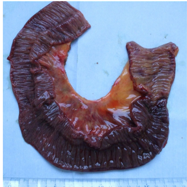
Figure 2: A picture of the resected strangulated small intestine.

Closure of the mesenteric defect caused by anastomosis after colectomy is not performed routinely in laparoscopic surgery [4]. Laparoscopic closure of the mesenteric defect requires a longer operation time, and incomplete closure may produce internal hernia of the small bowel. There is no consensus concerning closure of the defect. Small bowel obstructions related to mesenteric defect are rare in laparoscopic colectomy. In the case reported here, the patient developed a strangulated ileus. A narrow defect caused by mesenteric adhesion may produce