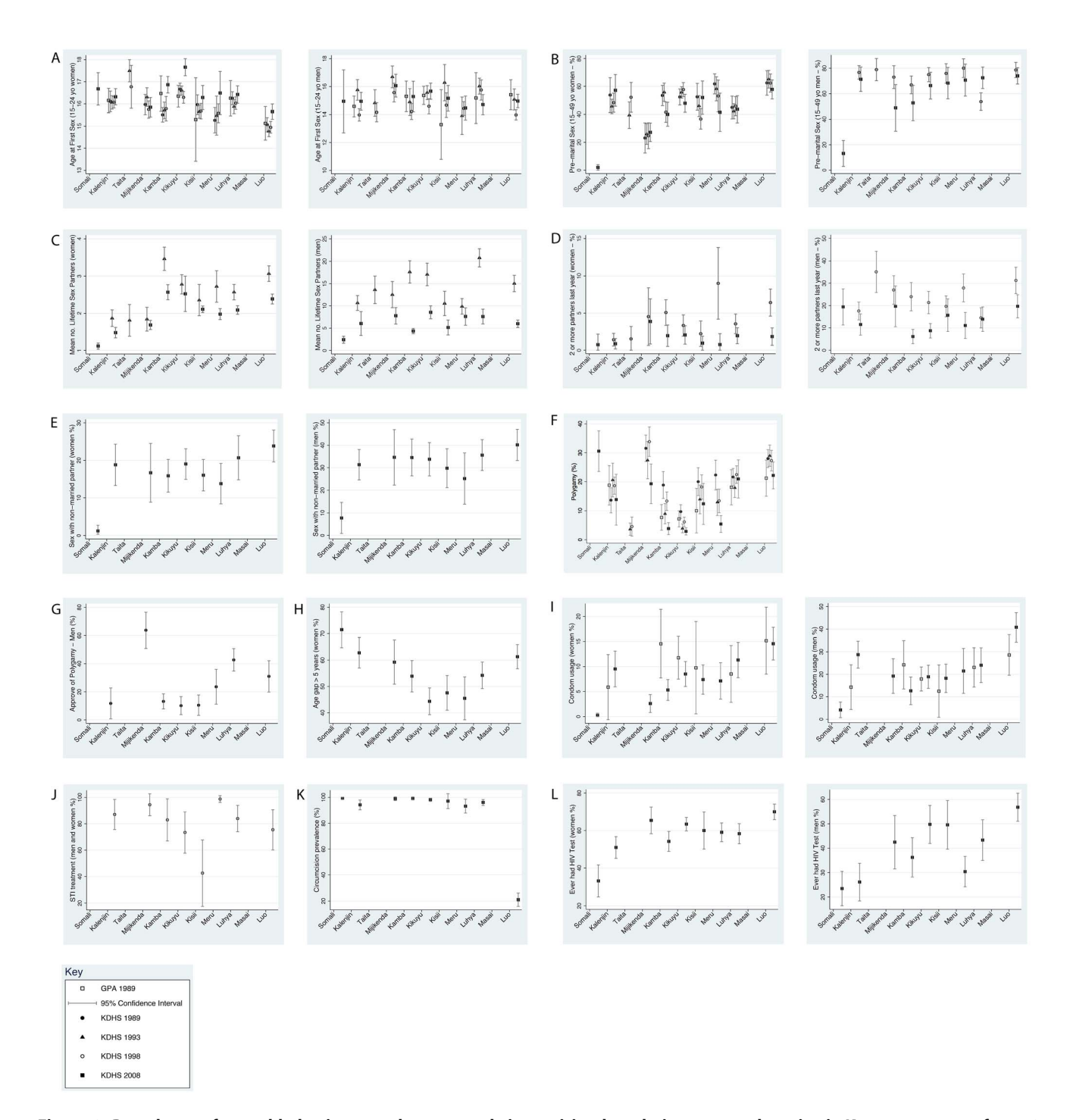
Figure 2. Prevalence of sexual behaviors, condom use and circumcision by ethnic group and sex in six Kenyan surveys of 15–49 year olds. Age of first sex (A), percent reporting pre-marital sex (B), mean number of lifetime sexual partners (C), percent reporting two or more sex partners in past 12 months (D), percent reporting sex with a non-married, non-cohabiting partner in prior 12 months (E), polygamy, (percent of married women who report that their husband has other wives) (F), percent of men who approve of polygamy (G), age gap – the percentage of women with a partner more than five years older than them (H), condom usage - percentage who reported ever having used a condom before (for GPA survey), and the percentage who reported using a condom at last sex (for KDHS 2008 survey - I), STI treatment - the percent who obtained STI treatment at a medical centre among those who reported having STI symptoms in the past 12 months (J), the percent of men who reported being circumcised (K), percent ever tested for HIV (L). Point estimates with 95% Confidence Intervals. KDHS (Kenya Demographic and Health Survey), GPA (Global Programme on AIDS).