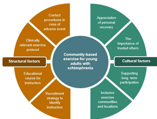
Figure 2 Structural and cultural factors of importance when developing community-based exercise targeting young adults with schizophrenia.

Contributors All authors participated in conceptualising the study. MFA, KR and JM planned the study design and methodology. MFA and KR were responsible for