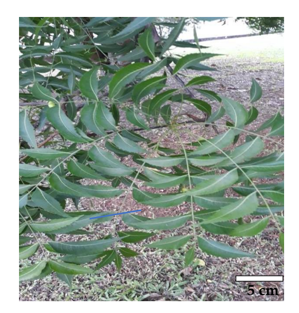
Figure 2. Azadirachta indica plant leaves.

The leaves of the plant A. indica (Figure 2) were collected from Universiti Malaysia Sabah, Kota Kinabalu (5.7346° N, 115.9319° E), Sabah, East Malaysia. The identification of the plant was carried out at the Institute for Tropical Biology and Conservation, Universiti Malaysia Sabah, Kota Kinabalu.