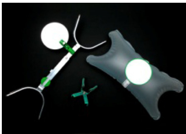
Figure 2 Appliances available to help facilitate clean intermittent self-catheterization. Note: Shown are thigh abductors, mirrors, and labial spreaders.

Lack of proper training was cited as a barrier to CISC in 5% of patients in one study, 18 which highlights the importance