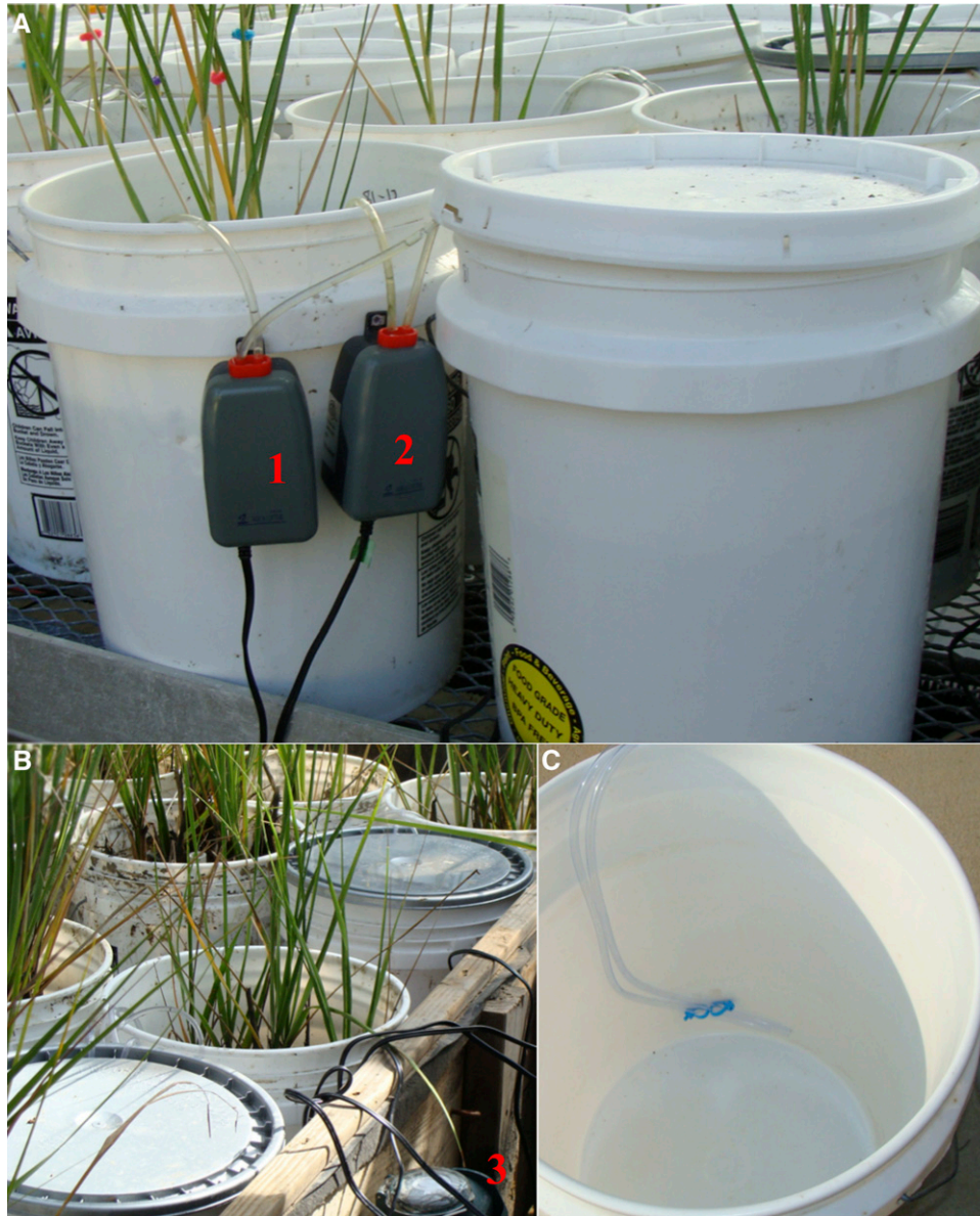
Fig. 1. Tidal simulator microcosm units consisted of one 18.9-L bucket containing a Spartina alterniflora sward connected to a second reservoir bucket (with a lid to prevent evaporation) by aquarium tubing attached to two water-lifting pumps. Pump 1 transferred water from the reservoir into the microcosm, and pump 2 transferred the water from the microcosm back into the reservoir (A). Units were connected to an outdoor timer (3) programmed to create tidal exchange every 6 h (B), and aquarium tubing extended from pumps to the bottom of both the microcosm and reservoir buckets to ensure complete transfer of water between them (C).

special facilities required by other systems (Table 1). Finally, growth of tidal marsh macrophytes in our simulators was tested against growth of plants exposed to natural tidal inundation in the field.