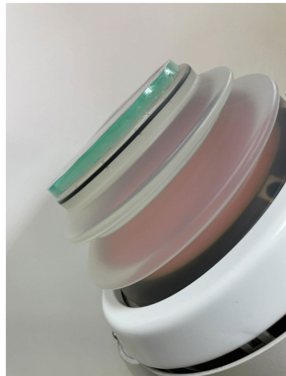
Fig. 1 A proprietary icPad (blue color) fit tightly on the treatment head

A total of 300 patients were enrolled in this study. 100 patients were treated in the Group P1, 97 patients in the Group P2, and 103 in Group C. The patients were divided into three groups (Group P1, P2 and C) according to different coupling medium (icPad or semi-liquid gel) and lithotripsy settings (energy level and total number of SW) (Table 1). All treatments were performed by attending urologists and assisted by an experienced nurse. Before the treatment, patient’s medical history, physical examination, urine analysis and radiologic investigation were performed. Characteristics patients and treated stones were recorded. Stone free (SF) was defined as complete absence of stone fragments and clinical insignificant residual disintegration (CIRD) was defined as stone burden less than 4 mm on KUB examination after ESWL. Successful stone disintegration rate (SSDR) of each group was calculated as the patients of SF and CIRD/total patients of each group and was used to evaluate the treatment effectiveness. All patients were