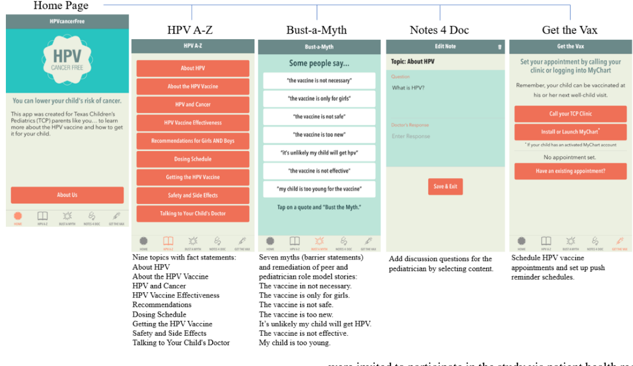
Figure 1. HPVcancerFree (HPVCF) components. HPV: human papillomavirus.

The purpose of this study is to evaluate the user experience of HPVCF, an HPV cancer prevention app designed for a pediatric clinic network, using mixed methods data collected from log files, survey measures, and qualitative feedback.