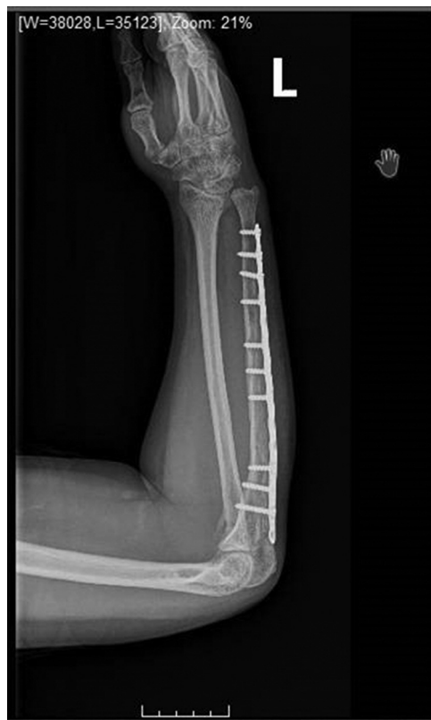
Figure 7 Lateral radiograph demonstrating reduction of the radiocapitellar joint and union of the ulna segmental fracture at 6 months postoperatively.

We are aware of 1 report of the posterior interosseus nerve (PIN) being entrapped in the radiocapitellar joint in a child, preventing