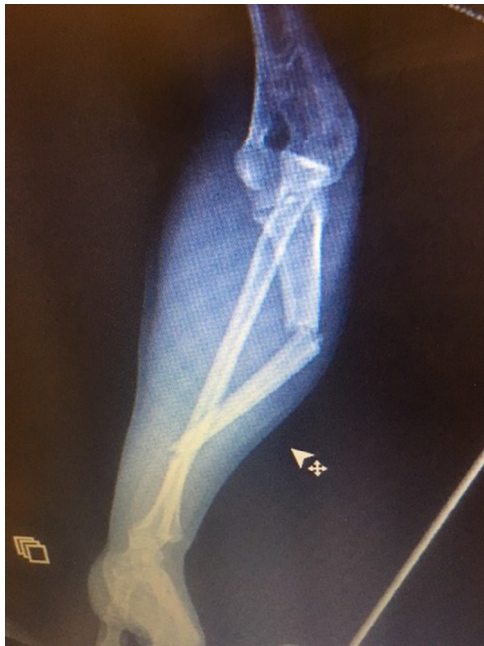
Figure 1 Segmental Monteggia fracture-dislocation.

at the previous procedure, the findings were discussed with the patient. He elected to proceed with an exploration.