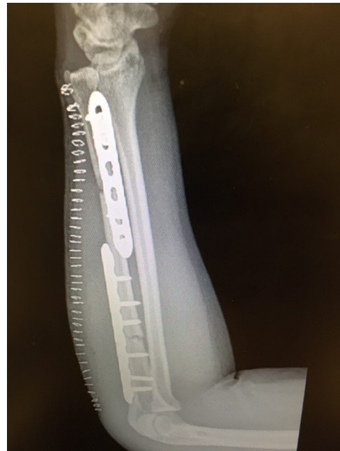
Figure 3 Initial open reduction and internal fixation present on referral.

reduction (Fig. 6). Once this tissue was excised, the radial head snapped back into place, with no alteration in the ulnar fixation (Figs. 7 and 8).