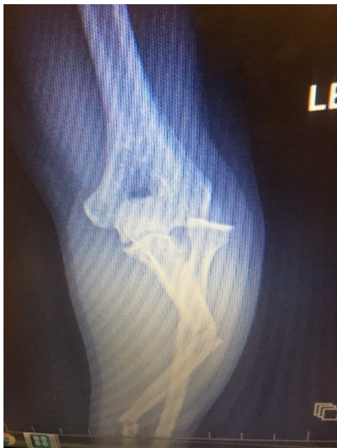
Figure 2 Anteroposterior radiograph of elbow, segmental Monteggia fracture-dislocation.

On more extensive exploration, the radial nerve was isolated between the extensor digitorum communis and the extensor carpi radialis brevis proximal to the radiocapitellar joint and in the supinator muscle distal to the radiocapitellar joint. Once localized in normal tissue, the nerve was followed to the site of entrapment in the radiocapitellar joint. The anterior elbow capsule and the radial nerve were seen to be infolded into the joint (Fig. 5). Once the radial nerve and capsule were dissected free, it became evident that interposed tissue in the proximal radioulnar joint was blocking