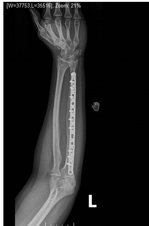
Figure 8 Anteroposterior radiograph demonstrating reduction of the radiocapitellar joint and union of the ulna segmental fracture at 6 months postoperatively.

reduction of the radial head. 9 In that case, the patient had a pre-operative PIN palsy. The PIN was lacerated on exposure of the radiocapitellar joint and was repaired.