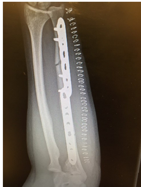
Figure 4 Initial open reduction and internal fixation present on referral, with radiocapitellar joint subluxated.

Six months after the procedure, the patient was pain free; the ulna had fully healed, the radiocapitellar joint remained reduced, and range of motion was improved ( 28^{\circ} - 118^{\circ} , with pronosupination of 42^{\circ} and 30^{\circ} ) (Figs. 7 and 8). The patient believed that he had fully recovered radial nerve function, but resisted extension revealed slight