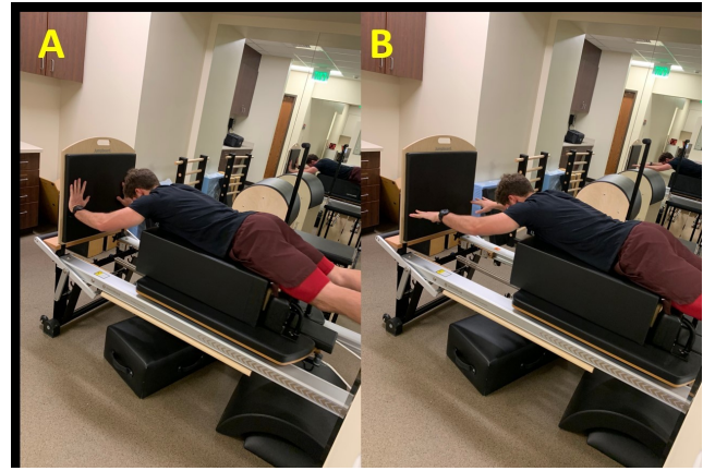
Figure 8. Plyometric UE jumps at start position (A) and end position (B) on Pilates reformer.

A graded return to full participation should include practicing the skills needed for the sport, initiating drills without contact, progressing to contact drills, increasing frequency and intensity of training situations to eventually meet the game requirements, with collaboration of the coaches in order to find appropriate progressions. Once the athlete is completing full training sessions which mimic the frequency and intensity of the sport and/or have successfully completed an ITP without pain, while also exhibiting proper throwing mechanics, introducing them to competition situations would be the final step. For overhead athletes an additional outcome measure, the Kerlan-Jobe Orthopaedic Clinic (KJOC) shoulder and elbow score, should also be completed and can be used to gauge readiness to return to full participation with a score of 90% or higher being needed, prior to returning to competition. 63