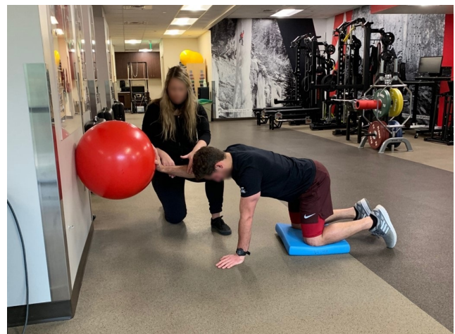
Figure 5. Rhythmic stabilization in quadruped position. The right limb is in an overhead, closed chain position.

rotator muscle strength ratio at 90° abduction has been emphasized in the literature with a minimum of 65% but optimal between 66% and 75%. 52,53