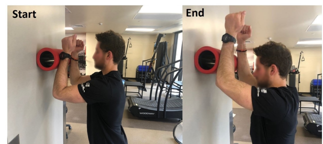
Figure 3. Wall slides to help activate the serratus anterior.

muscle activation when muscles are activated in functional patterns and when muscles are activated in specific diagonal patterns using kinetic chain sequences. Examples include resisted PNF exercises (Figure 4) and Crossover Symmetry exercises.