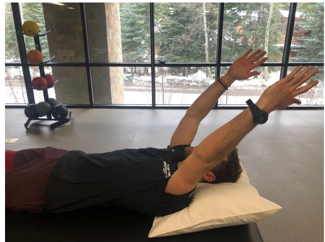
Figure 2. Joint position sense exercise: Patient in supine position with closed eyes. First, the uninvolved extremity is actively moved, then the affected extremity is moved to as close to that position as the uninvolved extremity.

The strengthening parameters in this phase should start with loads which correspond to a repetition range of an 8-12 repetition maximum (RM) for 3-6 sets. 42,43 These guidelines allow for a safe increase in load of the shoulder joint and are sufficient to create muscular adaptations. 43 External load can be added to therapeutic exercises in the form of manual resistance from the rehabilitation specialist, dumbbells, medicine balls, kettle bells, sports cords and TheraBand™. Most exercises early on in this phase will focus on strengthening specific muscle groups, such as shoulder external rotators or shoulder internal rotators. Once baseline strength has been established in each muscle group, functional movements with the involved upper extremity will start to replicate movement patterns involved in day to day activity as well as sports performance. De Mey and colleagues 44 have demonstrated maximal scapular