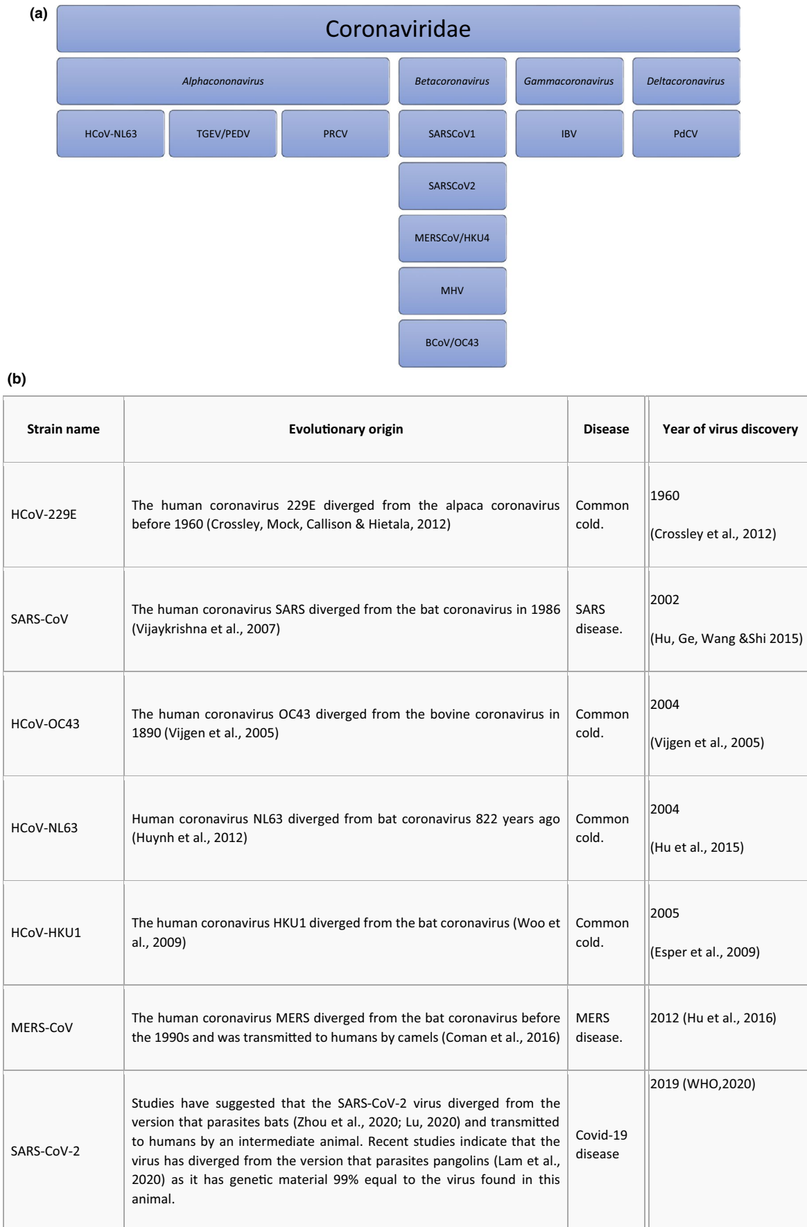
FIGURE 1 (a) Coronavirus: genera and species. (b) Human coronavirus