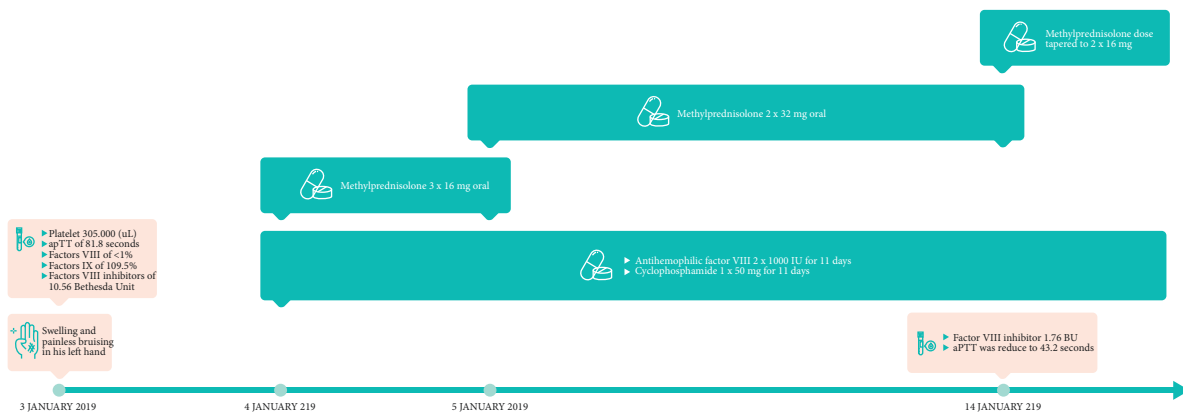
FIGURE 3: Timeline of events and interventions for case 3.