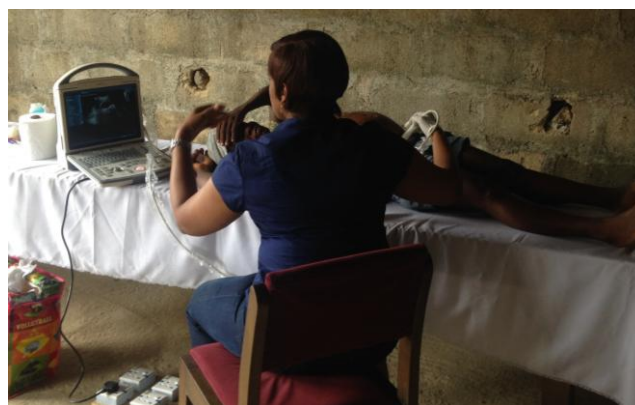
Figure 2: Pelvic-Ultrasound scanning during the medical outreach

A typical sonographic scan being carried out is shown in Figure 2.