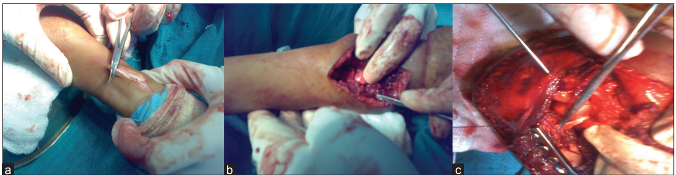
Figure 3: Peroperative clinical photographs of annular ligament reconstruction with Palmaris longus graft: (left to right) – (a) Harvesting Palmaris longus. (b) Identification of the remnants of the annular ligament. (c) Reconstruction with Palmaris longus

telephonic conversations. The average lapse to time from trauma to surgery was 1.6 years (ranging between 6 months to 3 years) for all four groups.