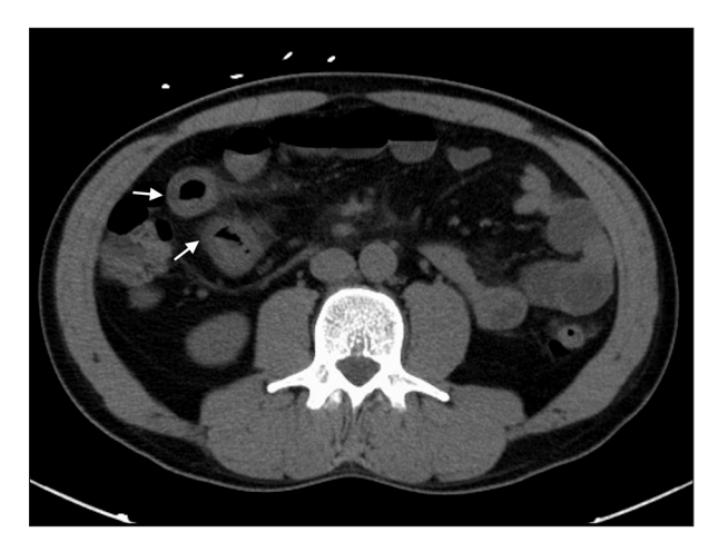
Figure 3. CT scan of the abdomen showing dilated loops of small bowel with circumferential mural wall thickening (white arrows).

antibody (ANCA) panel with c-ANCA, p-ANCA, myeloperoxidase (MPO), and proteinase 3 (PR 3) was negative. An immunoglobulin panel including IgG subtypes was within normal limits, as were serum complement levels including C3 and C4. There were no other concerns or risk factors noted for immunodeficiency. A chest x-ray and abdominal obstruction series showed no acute findings. A CT scan of the abdomen and pelvis was notable for several dilated loops of small bowel with circumferential mural wall thickening, mesenteric edema, and mild ascites (Figure 3). Cultures were obtained and he was admitted for further work-up.