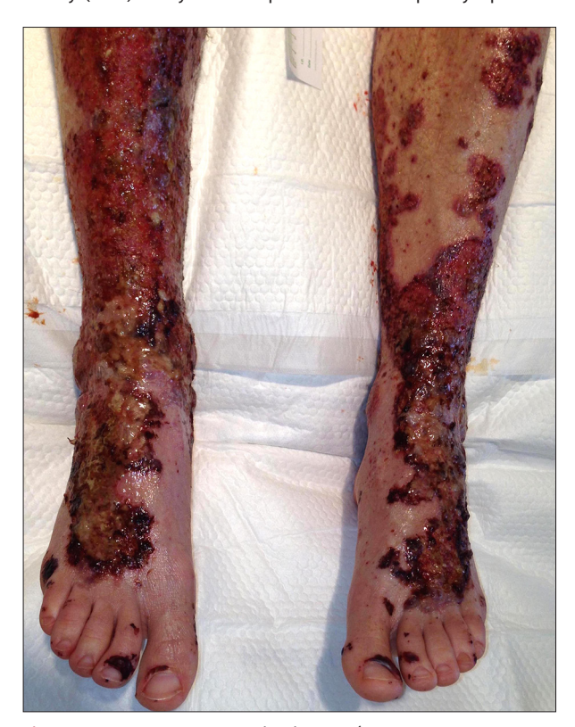
Figure 2. Extensive necrotic skin lesions (on presentation to our hospital Emergency Department). Notice the development of palpable purpura now evident, in addition to the necrotic areas.

Laboratory data revealed a leukocytosis of 22,500 cells/cu mm (N: 4,000–11,000), thrombocytosis of 459,000 cells/cu mm (N: 150,000–450,000), and mild anemia. His ESR was high at 55 mm/hr, and CRP was elevated at 4.2 mg/dL. The liver profile showed elevated aspartate aminotransferase (AST), alanine aminotransferase (ALT), and alkaline phosphatase (ALP) of 75, 105, and 161 U/L, respectively. Viral serology, including a hepatitis panel, was negative. The rest of the laboratory data, including prothrombin time, renal function with electrolytes, and a urinalysis with microscopy were within normal limits. Initial autoimmune work-up including antinuclear antibody (ANA) assay and complete anti-neutrophil cytoplasmic