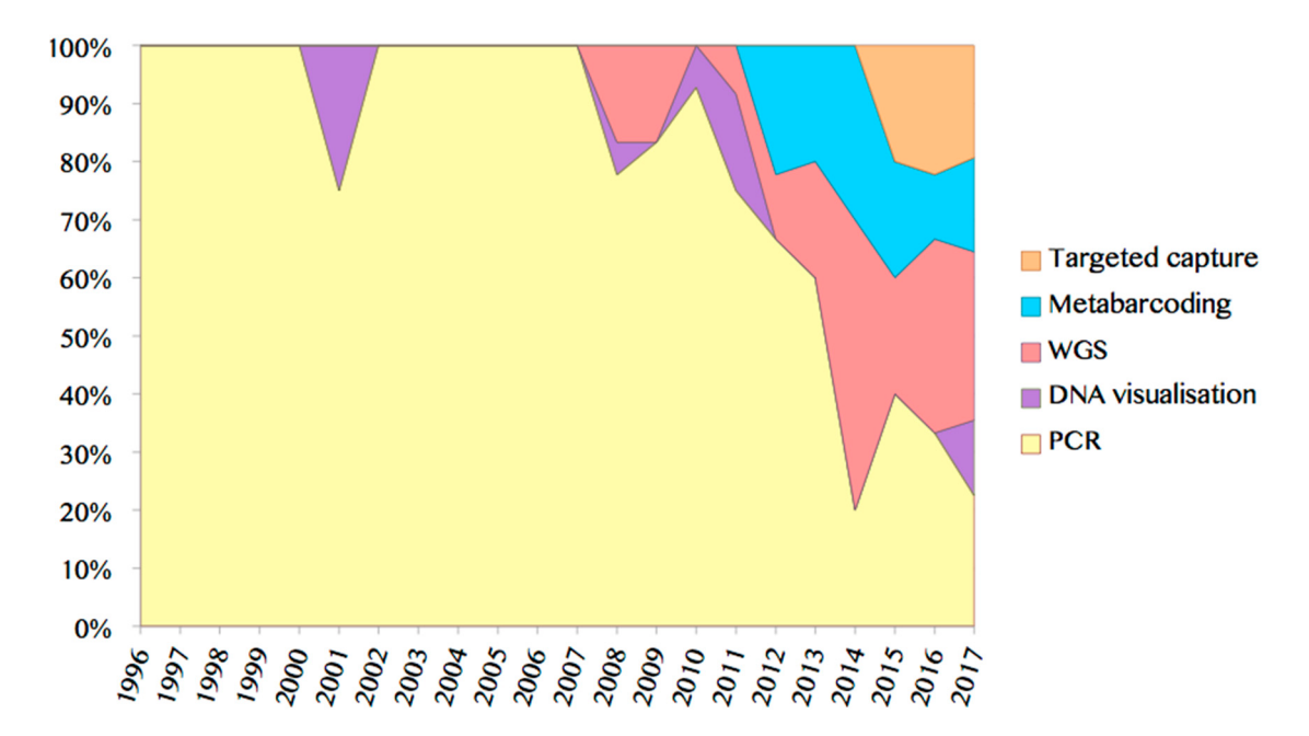
Figure 2. Area chart displaying the proportion of studies utilizing various methods in the analysis of neglected substrates, demonstrating the rise of whole genome and metagenomic approaches following the emergence of NGS technologies (includes studies reviewed in this paper, from 1996 to May 2017). WGS: whole genome sequencing; PCR: polymerase chain reaction.

While early studies obtained ancient genetic sequences through PCR coupled with Sanger sequencing, since 2010 there has been a greater push towards metabarcoding and whole genome approaches coupled with high-throughput sequencing (Figure 2). Here again, bespoke analytical methods may vastly improve our access to ancient genetic information particularly when studying unusual substrates that are suspected to preserve only highly fragmented DNA. For example, Gansauge et al. [258] and Stiller et al. [259] both recently noted significant improvements in library yields from formalin-fixed tissues using a single-stranded vs. a double stranded library preparation method. Similarly, Gómez-Zeledón et al. [56] achieved success in recovering informative SNPs from highly fragmentary and inhibited archaeological wood samples using optimized TaqMan qPCR assays.