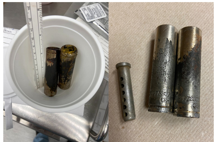
Image 3. Images of the retrieved foreign bodies in the operating room, which were reported to be two AA batteries per the patient. Closer evaluation reveals foreign bodies are two, approximately 3.5-cm metal sockets typically used with a socket wrench and a clevis pin, which was nested within one of the sockets creating the illusion of an AA battery silhouette on plain film.

Ferromagnetic and conductive metal fragments are subject to translational attraction and torque when under strong magnetic forces, which may ultimately lead to dislodgement or excessive heating. 1 One case report discusses a three-year-old child obtaining an MRI of the head prior to sinus surgery where there was found to be extinction of the face on the first MRI image, but not appreciated on initial scout imaging. 2 A button battery lodged within the nostril was identified on further physical inspection and removed. Another case report discusses a 65-year-old metal grinder complaining of acute severe left eye pain during MRI of the brain, which was immediately terminated. 3 The patient unknowingly had a metal fragment in his eye, which was ultimately removed by an ophthalmologist. In these cases, MRI screening questioning failed due to the inability to obtain history from a child and