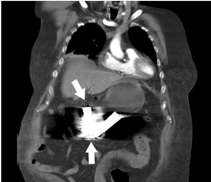
Image 2. Computed tomography of the abdomen and pelvis demonstrating foreign bodies that appear to be in the stomach with extensive artifact due to metallic foreign bodies. Bottom arrow points to two foreign bodies, which were reported to be two AA batteries per the patient. Top arrow points to free air within the peritoneum suggesting hollow viscus perforation.

viscus injury with unclear perforation site due to extensive metallic artifact and pneumoperitoneum (Image 2).